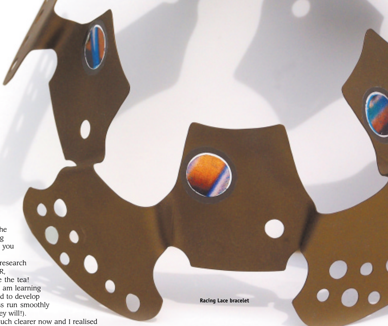
Racing Lace bracelet

E: poppy.porter@btinternet.com www.poppyporter.co.uk M: 0794 1117782