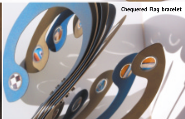
Chequered Flag bracelet